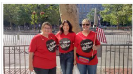
PONG spreading hate at the Boston Hate Pride March

Who would drive 2+ hours On I-20 to get to Dallas to hate on the LGBT community? Well, let's meet our grifters!